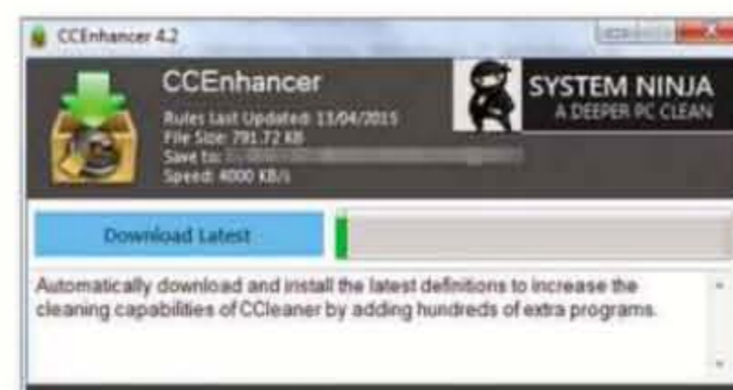
Click Download Latest in CCEnhancer to ensure you've got the plug-in's latest extra definitions

If you've installed the excellent free CCleaner plug-in CCEnhancer ( www.snipca.com/16390 ) and are wondering why its extra definitions haven't appeared in CCleaner itself, it's because CCEnhancer doesn't actually come with any definitions – you have to download them separately. Launch CCEnhancer then click the blue Download Latest button, and then launch (or restart) CCleaner.